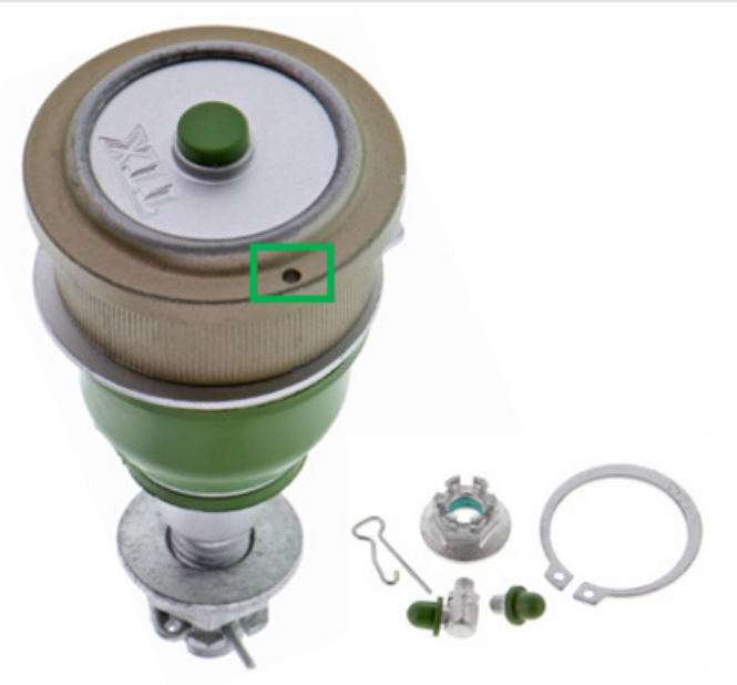
Figure 2. Drilled index mark on ball joint flange (callout box)

• During press-in, index mark must be oriented so that it is perpendicular to the wheel (facing outboard). For an illustration of correct installation orientation, see Figure 3.