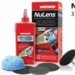
NuLens Headlight Renewal Kit 37251

Includes: PowerBall 4Lights Polishing Tool. 8 oz. PowerPlastic 4Lights Liquid Polish. 3-inch Backing Plate Restoration Discs Instruction Sheet