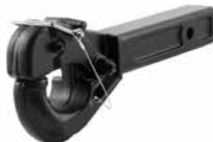
Receiver-Mount Pintle Hook (2" Shank, 20,000 lbs., 2-1/2" Lunette Rings)