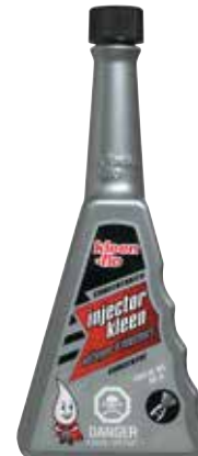
Injector Klean 695 - 395ml