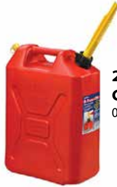
20 Litre RV Gasoline Container 03609