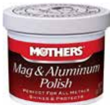
Mag & Aluminum Polish 35100 5oz