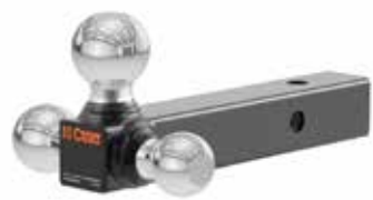
Multi-Ball Mount (2" Hollow Shank, 1-7/8", 2" & 2-5/16" Chrome Balls)