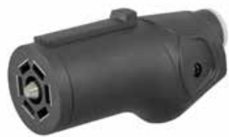
Heavy-Duty 7-Way RV Blade Connector Plug (Trailer Side)