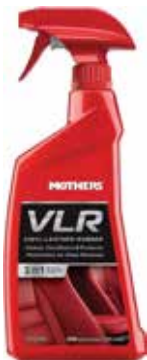
VLR Vinyl•Leather•Rubber Care 36524 709 ml