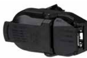
OEM Replacement Dual-Out- put 7 & 4-Way Connector (Plugs into Any US CAR)