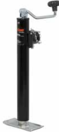
Pipe-Mount Swivel Jack with Top Handle (5,000 lbs, 15" Travel)