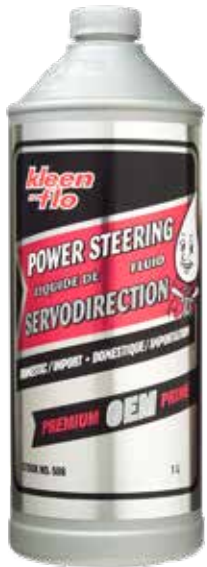
Power Steering Fluid 586 - 1L

You can use this Tapered Wooden Handle with Wood Deck Brush with Squeegee, a 7" Masonry Brush with Union Fibre or any other cleaning tool with a tapered connecting hole.