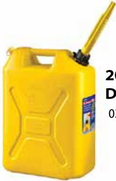
20 Litre RV Diesel Container 03711