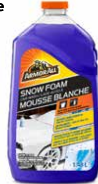
Snow Foam Car Wash 19159 1.48L