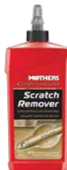
California Gold Scratch Remover 38408 236 ml