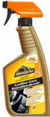
Premium Leather Care 18981 473ml