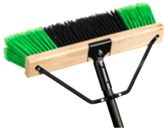
Ryno Push Broom PB-700-GB24 - 24"/60cm Medium Sweep Brace and handle - Assembled