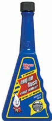
Engine Flush 637 - 350ml