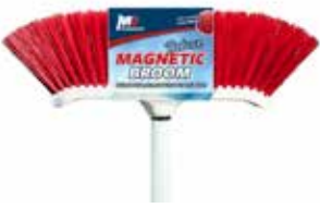
Venus Curved Magnetic Broom With 48" Metal Handle BM-4200