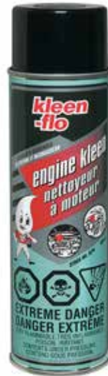
Engine Klean 824 - 454g