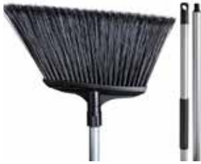
16" Hercules Industrial Angle Broom BA-3000