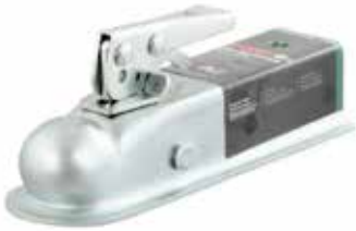
2" Straight-Tongue Coupler with Posi-Lock (3,500 lbs, Zinc)