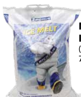
Michelin Ice Melt (20kg) 7000