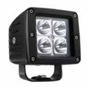
4800 Raw Lumens, Small Cube BZ221-5