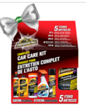
Complete Car Care 5pc Kit 18378

Tire Foam Protectant Ultra Shine Wash and Wax Original Protectant Cleaning Wipes Auto Glass Cleaner