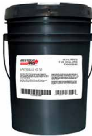
BESTBUY PRO HYDRAULIC 18.9L