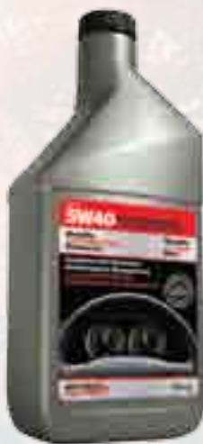
QAP 5W40 Oil QSYN5W40-1X6 Sold by case of 6