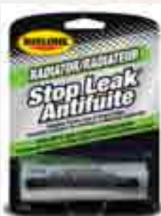
Radiator Stop Leak and Conditioner 31170