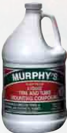
Liquid Tire and Tube Mounting Compound 1950 1 gallon