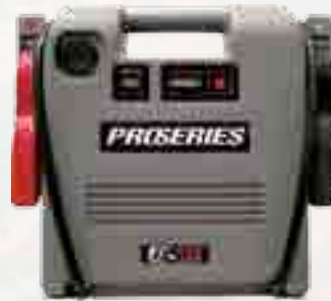
Jump Starter and Portable Power Unit PSJ-1812