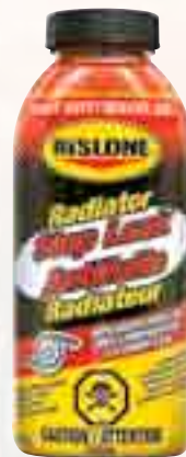
Rislone Pelletized Stop Leak 31191