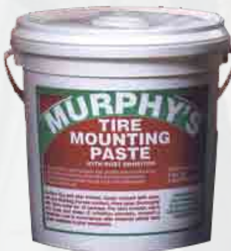
Euro Tire Mounting Paste 2146 8lb Pail