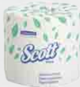
SCOTT® Bathroom Tissue 48040 2-ply