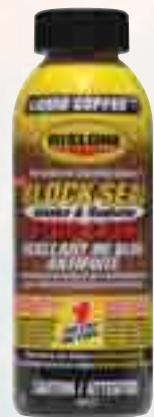
Rislone Liquid Copper Block Seal and Radiator Stop Leak 31109