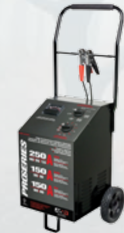
250/150A 6/12/24V Manual ProSeries Wheel Charger w/Engine Start PSW-61224