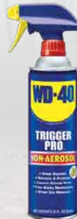
WD-40® Multi-Use Product Trigger Pro® 20 oz 01219