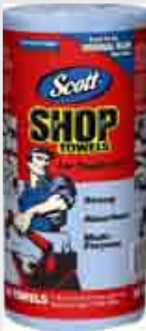
Shop Towels 75120