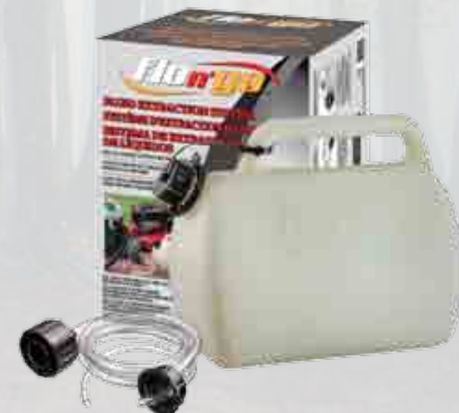
Fluid Extraction System 09644