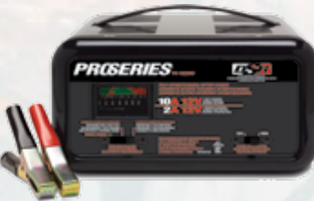
2/10A 12V Automatic/Manual ProSeries Bench Charger PS-1022MA