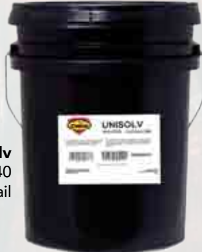
Cobra Unisolv FBB0009140 18.9L Pail