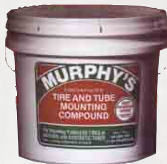
Tire and Tube Mounting Compound 2000 8lb Pail