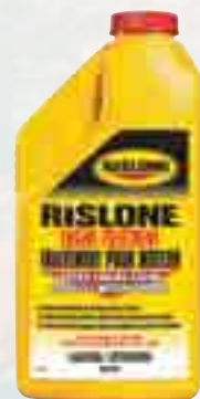
Rislone Engine Treatment 34100