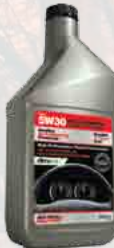
Dexos 5W30 Oil QSYNDEXOS-1X6 Sold in case of 6