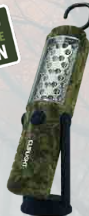
33 LED Pivoting Worklight 24-460