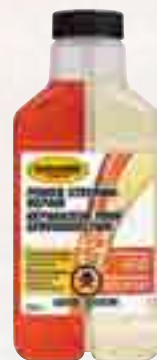
Rislone Power Steering Repair 34650