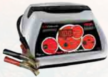
2/10-20/80A 12V Automatic Speed-Charge Hybrid Charger w/Engine Start SCF-8020A